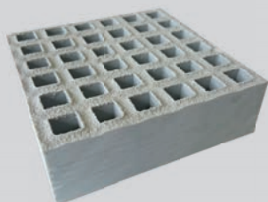
MESH 38 X 38 OU 19 X 19 HEIGHT 38