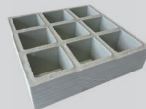
MESH 38 X 38 OR 19 X 19 HEIGHT 30