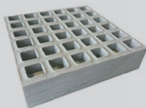
MESH 19 X 19 HEIGHT 25