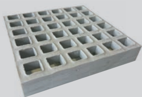
MESH 19 X 19 HEIGHT 20